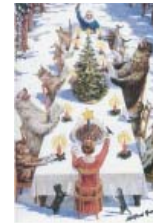
008 Dinner Party Everywhere, Everywhere, Christmas Tonight