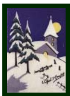
013 Last Sketch Wishing you a Merry Christmas and a Happy New Year