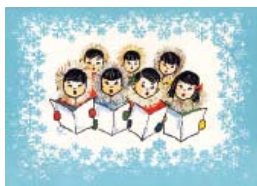
010 The Carolers Rejoice... In the spirit of Christmas, which is Peace in the miracle of Christmas, which is Hope and in the heart of Christmas, which is Love. Happy Holidays