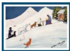
011 Christmas Eve Wishing you a Merry Christmas and a Happy New Year