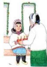
009 Christingle The Spirit of Christmas is a little magical, a little mystical and a lot of wonderful.