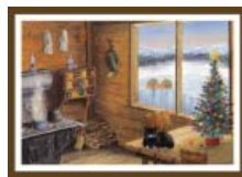
012 Christmas at the Cabin Wishing you a Merry Christmas and a Happy New Year