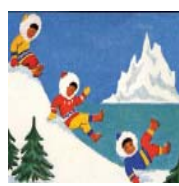
007 Fun in the Snow Wishing you a Merry Christmas and a Happy New Year