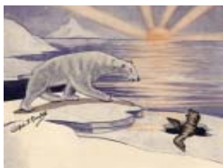
004 Northern Friends Season's Greetings