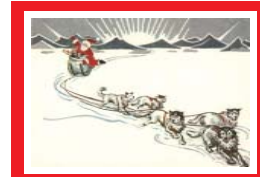
006 Santa's Sleigh Wishing you a Merry Christmas and a Happy New Year