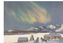
017 Heavenly Dancers Christmas Greetings and Best Wishes for the New Year