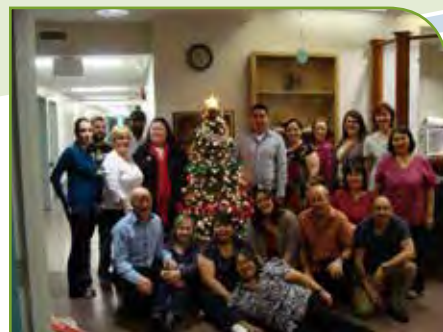
▲ Staff at the Nain Community Clinic pause a moment for a photograph during the hustle and bustle of the Christmas season.

Staff at the Nain Community Clinic host a Christmas party annually for the elders in the community. With assistance from the Nunatsiavut recreation department, it's a party that the elders really look forward to, complete with Santa's visit and gifts for everyone, compliments of Vale. There is considerable planning that goes into the party, including the formal request to Vale for gifts and letters to businesses in the community to help with purchasing food for the dinner. The Nain clinic staff is truly dedicated to this endeavour and every year