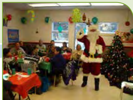
▲ Santa Claus made an appearance at the elders' Christmas party in Nain, much to the delight of the honoured guests.