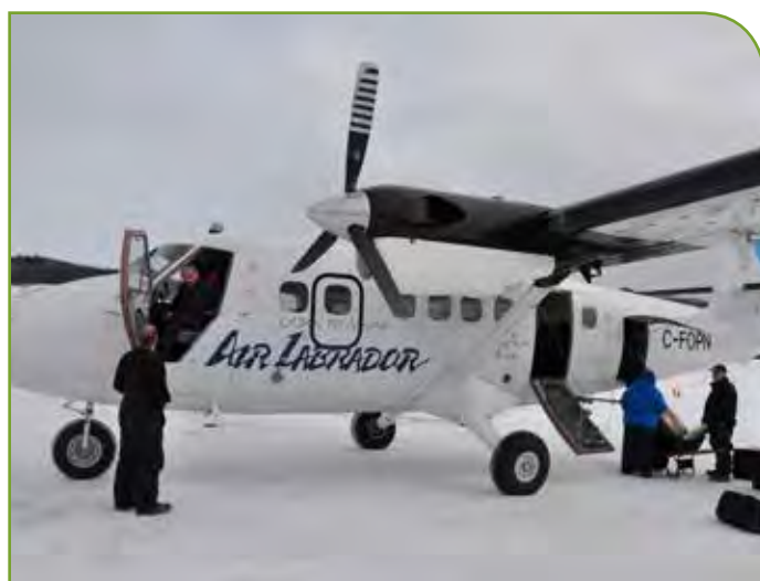
▲ The Labrador-Grenfell Health scheduled service takes on passengers and freight during a brief stopover at the Charlottetown airstrip while en route to Happy Valley-Goose Bay.

The chartered air service operates three days a week – Mondays, Wednesdays and Fridays. Information is available by calling the toll-free