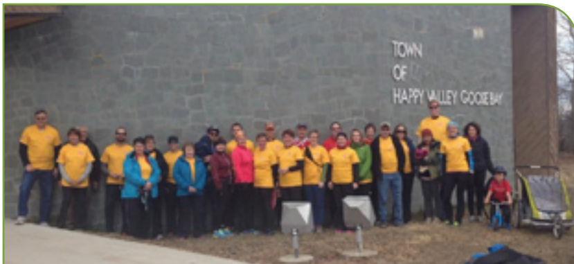
▲ Labrador-Grenfell Health staff and community members participated in the annual Alzheimer's walk, which took place on May 11, 2014 at Happy Valley-Goose Bay.