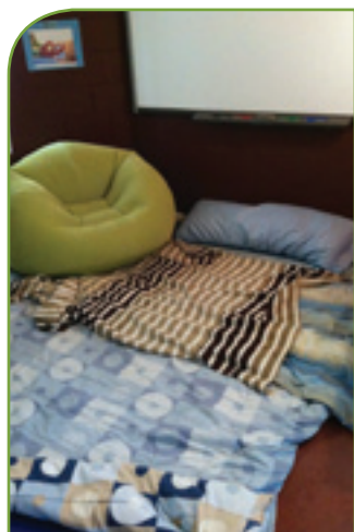
▲ A relaxation room for students at Mealy Mountain Collegiate in Happy Valley-Goose Bay.