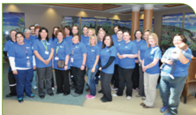
▲ Registered Nurses who work at the Labrador Health Centre and the Long-Term Care Facility in Happy Valley-Goose Bay were attired in blue T-shirts to bring awareness to National Nursing Week.